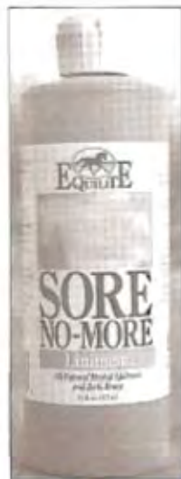
Sore No-More is again a top pick.

Remember that liniments with counterirritant ingredients stimulate blood flow to the area, which can worsen acute inflammatory swelling. If you suspect the horse has an acute injury to the muscle, icing should be used for the first 24 hours and it can be combined with a mild liniment (the liniment can be cooled before applying). The problem with cold therapy—and you must be careful about this with acute injury—is that it can trigger spasms.