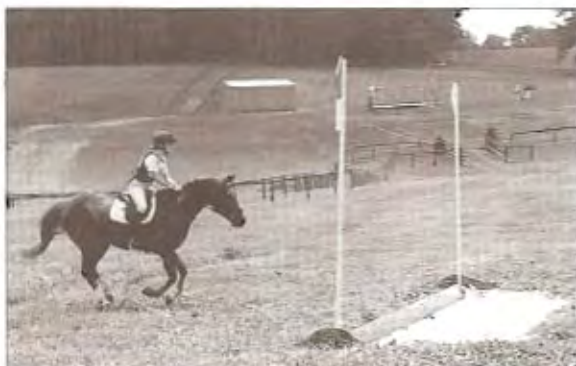
Hard-working horses deserve special care.

who can benefit from liniments. Even weekend warriors need the relief provided by liniments, in some respects even more so. Horses get stiff and sore from overdoing it just like we do. Adding a liniment to your after-work rinse water makes it easier to cut through sweat and grime, has an antiseptic effect on skin irritations and has a cooling, invigorating effect on the horse. When the horse has dried, rub in full-strength liniment over the back, rump, chest muscles and lower legs for a stronger soothing effect.