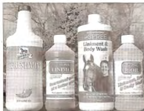
Stronger solutions are not always best, and these products are our top picks for mild liquid liniments.

We used our liniments both as routine post work-out care and on horses with muscle issues, sore joints or minor tendon/ligament problems. Our testers liked the convenience and less waste associated with gels or thick-cream consistency products. However, you can counter this problem by using a spray