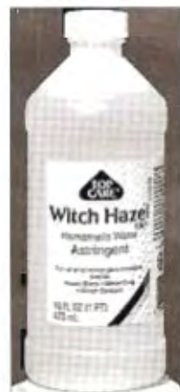
Witch hazel is a good choice to dilute liniments.

When using a liniment for the first time, do not massage vigorously, apply to a hot horse, use with heat, or use under a bandage. Never combine products, even in wash water, or use liniments in the saddle area if you plan to ride soon.