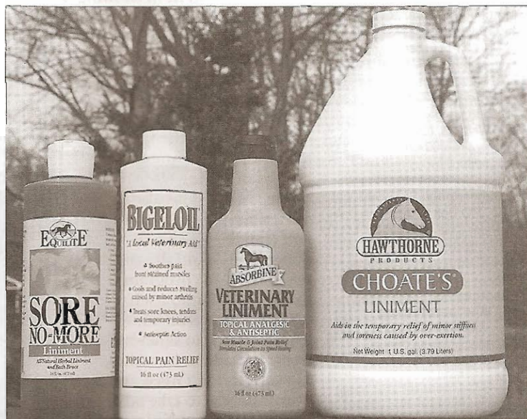
Liniments . . . page 3