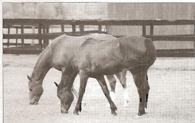
Case history . . . page 16