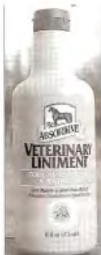
Absorbine Liniment is a classic choice.

bottle to apply the liniment to the skin then brace it into the leg as you normally would. We prefer liquids as they more easily mix with wash water and penetrate to the skin level easier. Testers also worried about skin irritation potential, safety under wraps and advisability of using gloves when applying the products. We've included that information