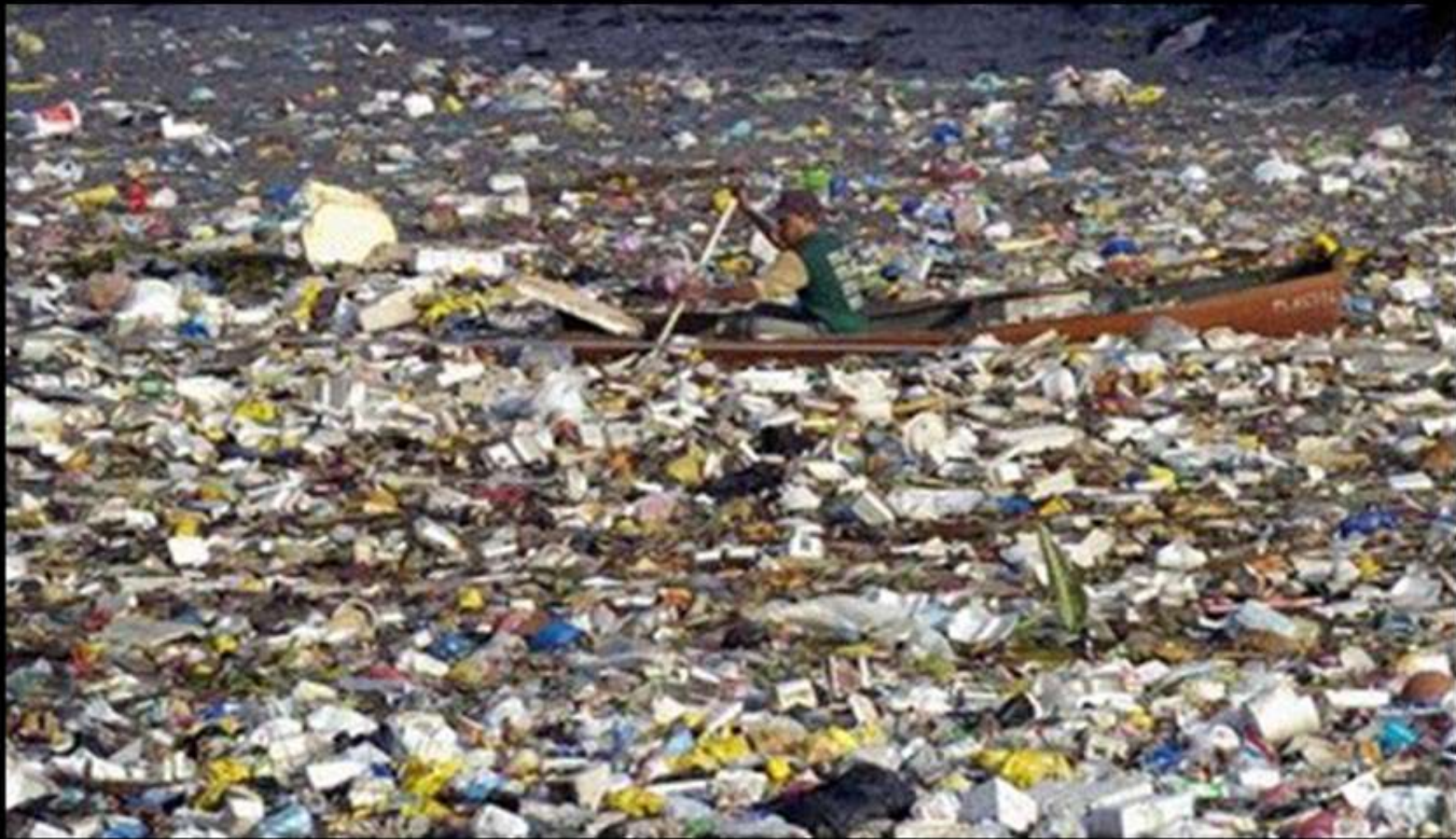
Photo of Pacific Ocean Year 2004